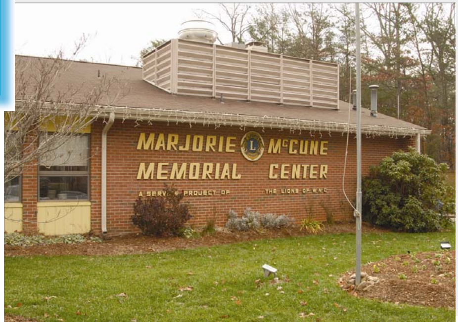
Daikin's Variable Refrigerant Volume (VRV ® ) System provides the assisted living center with performance equivalent to a premium chiller system, in a package that is easy to install, cost effective, and allows each room's temperature to be set at the residents' personal preferences.

The decision was made to remove the PTACs which had been in place for decades. They began requiring more and more repairs, and had become progressively more costly to run. In their place, the highly