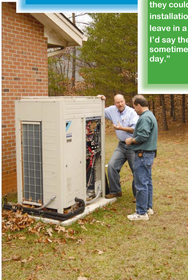
Daikin's VRV replaced a very large and expensive-to-run boiler that had to stay in operation from the end of September through May. In contrast, the VRV provides heating and cooling to individual areas, on demand, only when required.

This is in comparison to a conventional system, which experiences fluctuations in dehumidification as a result of conventional ON/OFF control. These