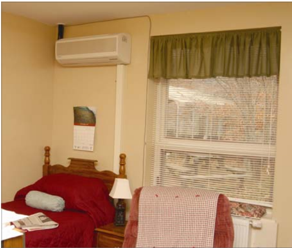
Each of the 32 rooms are served by FXAQ duct-free wall-mounted indoor units.

compact indoor units measure approximately 11 inches high by 31 inches wide by 9 inches deep.